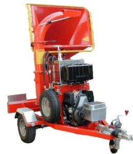
Model : BIO 230