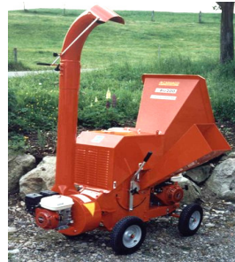
Model : BIO 200