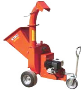
Model : BIO 190