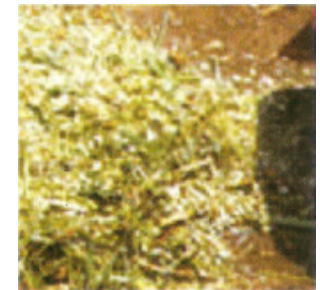
Mulched Coconut Leaves